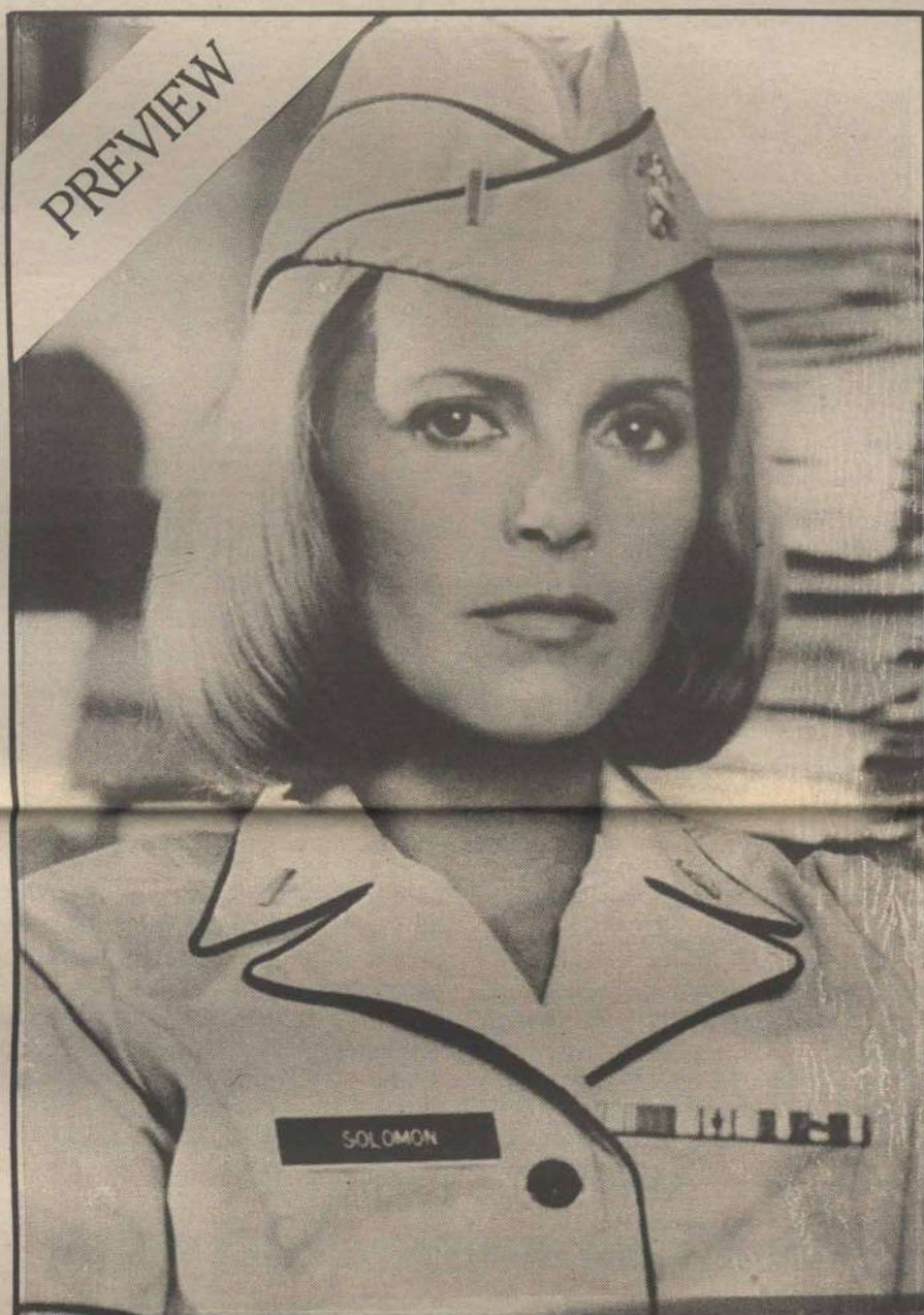
Cheryl Ladd, who replaced Farrah Fawcett Majors on "Charlie's Angels" during the mid 1970's, stars as a Navy Nurse in director Sidney J. Furie's "Purple Hearts." A review of "Purple Hearts" will appear in next week's Current.

"Children of the Corn" is a typical Stephen King novel-turned film. There are many tight camera shots that attempt to mask the upcoming violence and make the violence more surprising. It's similar to almost every horror film made since "The Texas Chainsaw Massacre," which was really the first ultra-bloody horror film. "Children of the Corn" can be summed up in one incomplete sentence: short on purpose for existence, long on popularity.